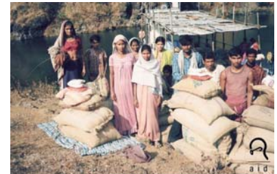
Food Grains Distribution

The Jansahyog Relief Project aims to provide food-grains, fishing nets for livelihood and medical aid to needy families. These families have not received any rehabilitation from the government after several years of displacement due to the Sardar Sarovar Project. Please read more on page 4 to learn about this AID wide initiative.