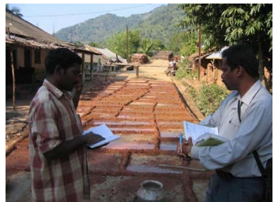
NREGA Audit in progress

National Rural Employment Guarantee Act is a landmark act passed by the Indian Government recently. This project promotes livelihood rights of agricultural workers and marginalized farmers by effective implementation of this act in 7 mandals (village clusters) of Chittoor district, AP. The project aims to create awareness about this act, facilitate obtaining of job cards for villagers, identify appropriate works for employment and undertake social audits and public hearings to ensure that workers get minimum wages.