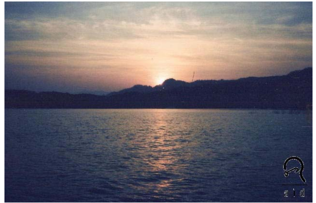
All is not well in the valley

In 2007, several chapters across AID (Austin, LA, Portland and Maryland) worked with Bombay Sarvodaya Friendship (BSF) center on the Jansahyog Project. Nearly 500 families in the submergence zone of the Sardar Sarovar Project were in dire need of food grains and medical supplies. These people, primarily the adivasis (tribals), are yet to be resettled by the Government. This is in spite of court orders to resettle people six months before dam construction. With nowhere to go and their livelihood destroyed due to agricultural lands coming under water, the people of the valley were facing acute food shortage.