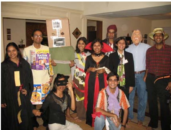
AID Dinner with a twist -“Halloween Party”