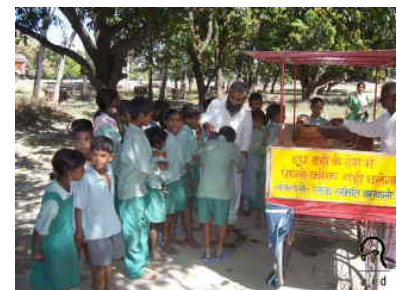
Free Potable Water in Public places

This project supports programs creating awareness about conserving water, rights and access to water, and water at the 'pani ka thela' at ten busy locations in Varanasi district. These water stops provide free water to all during the hottest summer months. The NGO also organizes street plays to emphasize rights to water, education and employment.