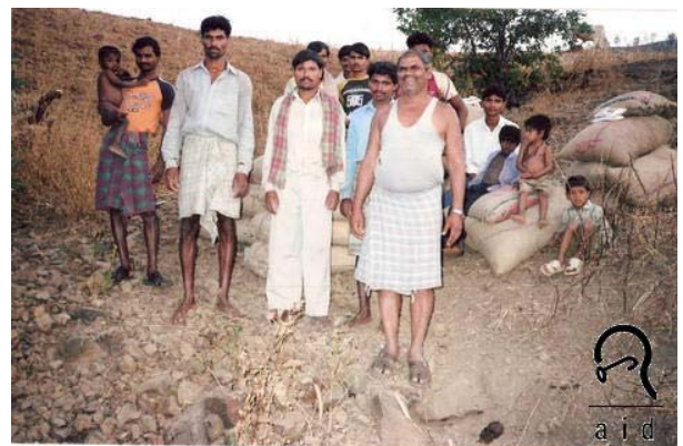
Food reaches the needy after a long journey on water and land

The Jansahyog project's goal is to provide basic food grains to the most needy families at the cost of Rs 7000 per family which would help them survive through this time of need. These families continue their peaceful struggle to get alternate lands promised by the Narmada Water Disputes Tribunal Award and the Supreme Court. Following the release of funds BSF coordinated the distribution of grains from the shops in towns to the hamlets in far off villages.