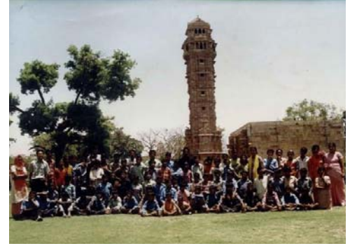
Students on a day trip to the city

We continued support to Education Summer Camp project aimed at reducing the drop-outs to zero in Chittorgarh district for the second year. This year nearly 100 children attended, a significant increase from 76 in 2006. In addition to formal subjects like English, Science, Maths and Hindi, the camp featured vocational training, yoga classes and cultural activities in the evening.