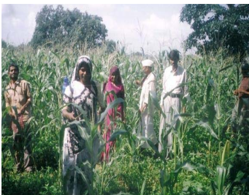
Training at an Organic Farm

This project aims to create awareness among the tribal and dalit population of the area (Chittorgarh Dist. of Rajasthan), especially people whose land has been illegally taken over (land-alienation) and bonded laborers. Previous work has included emancipation of bonded laborers, awareness against the flawed below poverty line assessment and campaigning for payment of minimum wages in Government sponsored projects. This year the NGO plans to increase awareness about NREGA and ensure that the rural employment guarantee act is implemented properly in the district.