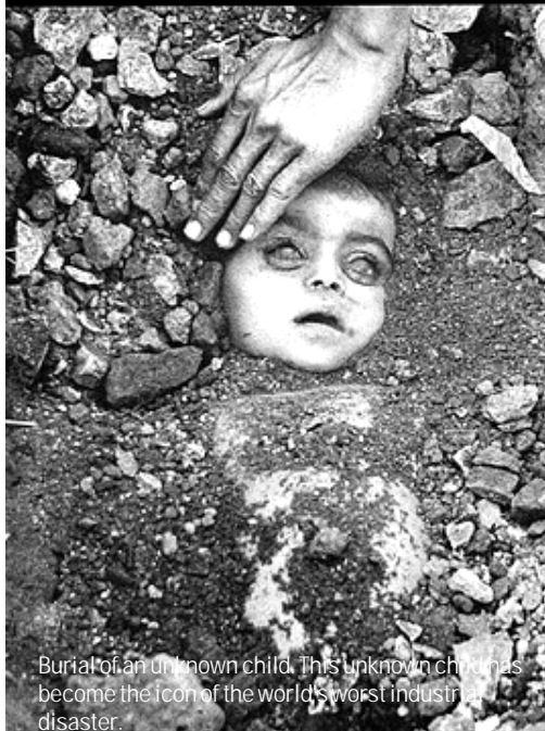
Burial of an unknown child. This unknown child has become the icon of the world's worst industrial disaster.

Dec 3rd, 2003 marks the 19th anniversary of the Bhopal disaster. This day has been declared as the - Global Day of Action Against Corporate Crime.